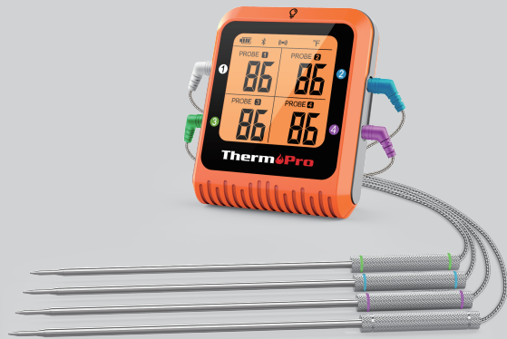
Bluetooth Cooking Thermometer

According to the operating system of your mobile, scan the following QR code to download and install.