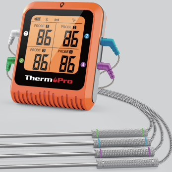
Bluetooth Cooking Thermometer

According to the operating system of your mobile, scan the following QR code to download and install.